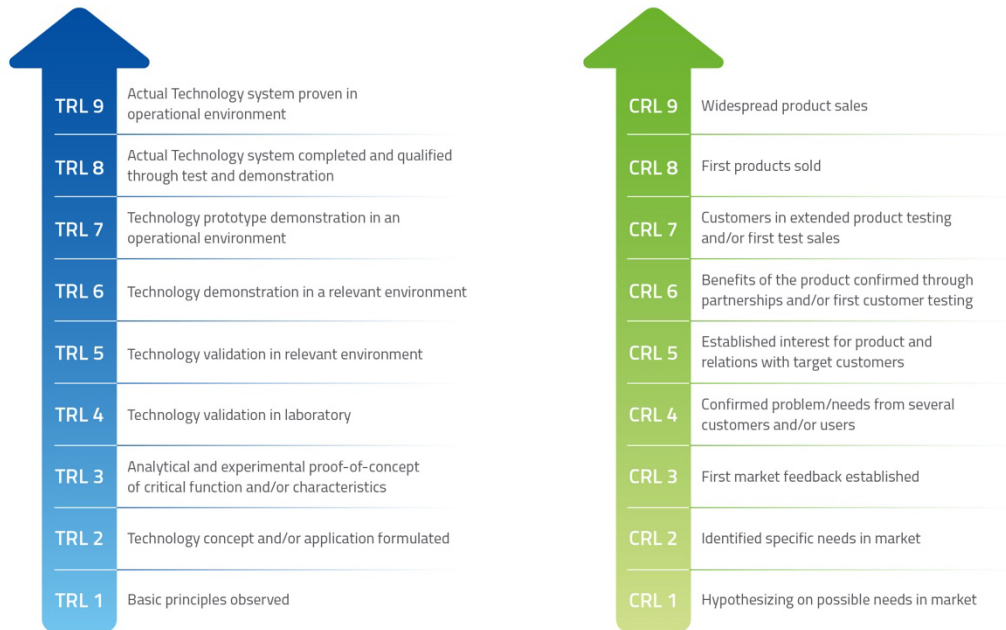
Figure 2. Technology Readiness Level (TRL) and Commercial Readiness Level (CRL)